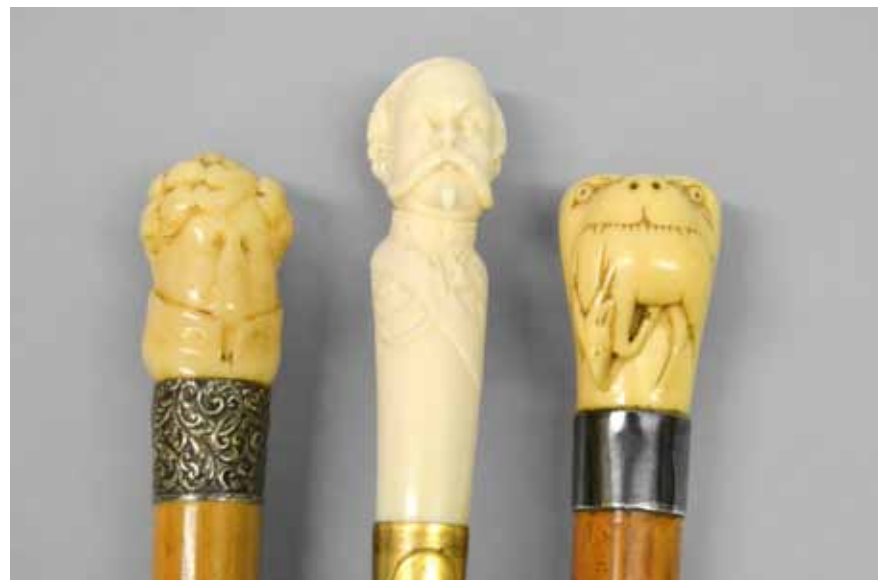
Ivory Handled Walking Sticks - Various Lots